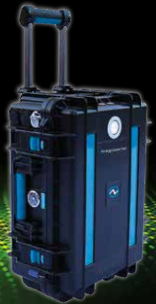
GenZero 500W 500Wh Capacity Battery